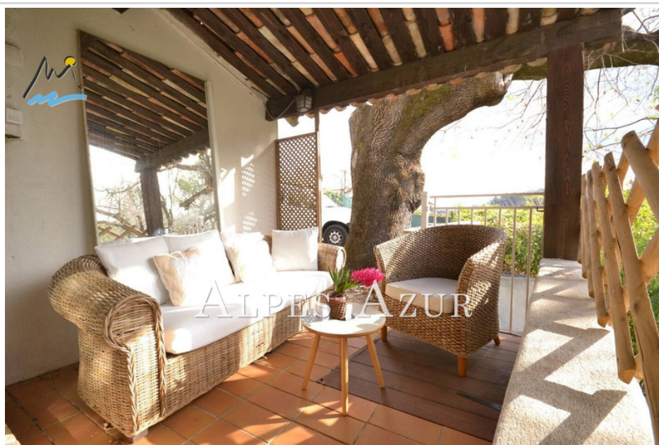
Villa La Gaudé

A REAL FAVORITE, QUIET IN THE FULL NATURE, 5 mm walk from the village of GAUDE with its shops and schools, our agency invites you to discover as quickly as possible this beautiful and atypical 5-room architect-designed villa discreetly adjoining corner located in a dominant position benefiting from a superb unobstructed view of greenery not overlooked and a beautiful mainly south-west exposure, the land planted with Mediterranean species offers a bucolic route and shelters a heavenly relaxation area enjoying a beautiful swimming pool and its pool house, a real living room, the air-conditioned interiors are bright and have a pleasant and family layout, a large living room made up of a living room and an intimate lounge with fireplace extended by a large terrace, the kitchen spacious and equipped opens onto a 2nd friendly terrace, 3 bedrooms, 2 bathrooms and 3 toilets, 2 cellars, a small workshop, parking in front of the entrance to the villa, BEAUTIFUL QUALITY OF LIFE,