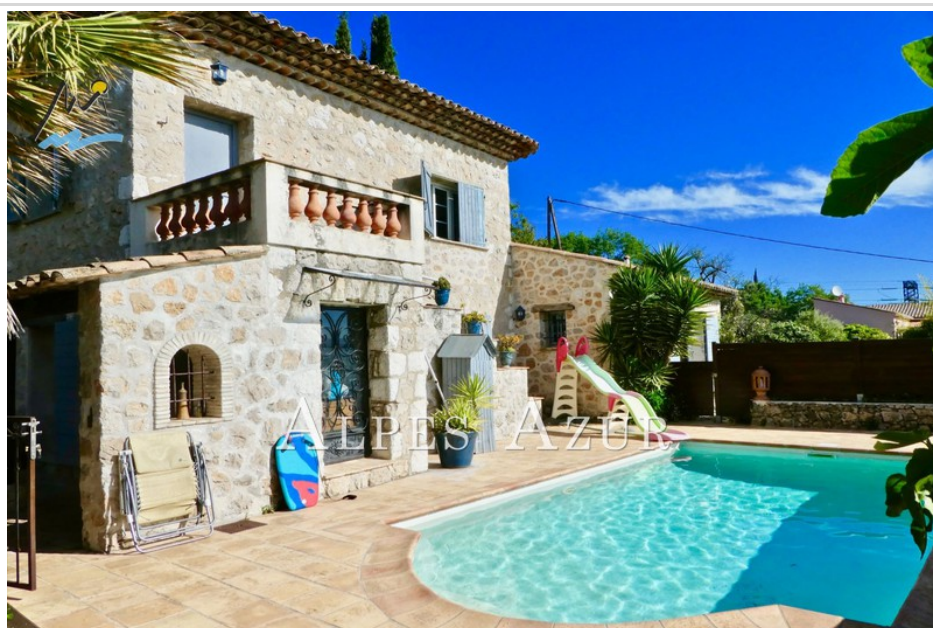
House La Gaude

From CHARM to ABSOLUTE CALM and in the heart of nature near the very picturesque village of TOURRETTES sur LOUP, our agency invites you to discover this beautiful Provencal house revealing beautiful local stones on the facades and benefiting by its dominant location from a panoramic view and a beautiful sunshine, the nicely wooded land benefits from vast terraces offering conviviality, relaxation and sunbathing around its swimming pool with its beach and its pool house, the bright interiors and the beautiful overall services benefit from a functional distribution in a 4-room apartment and an independent studio, the large and comfortable living room with its beautiful Provencal fireplace on a stone wall allowing everyone to choose their living and sharing space communicates with a covered terrace, the kitchen is equipped and has a dining area and opens onto a veritable summer dining terrace, 3 bedrooms, 2 of which are spacious open onto a beautiful terrace offering a received sea, an independent studio on the ground floor with a large bay on the terraces and the swimming pool benefits from an office, a kitchen, a shower room, a toilet and a dressing room, a workshop, a shelter for 2 cars and indoor spaces, COUP de COEUR INSURED, 695,000 euros, Fees